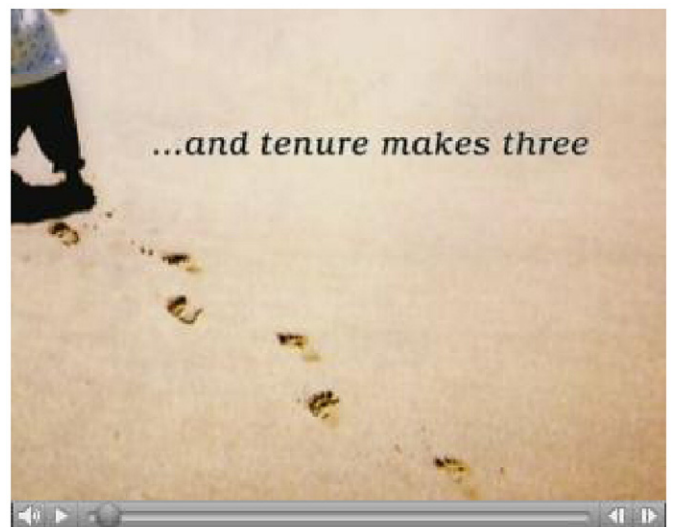
Fig. 2. Joanna Dunlap's “... and tenure makes three” digital story. http://www.augustcouncil.com/~jdunlap/JoniDunlapSOR.mov .