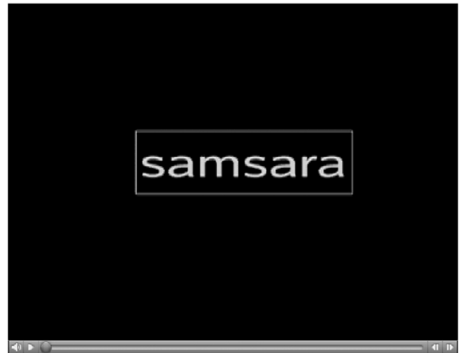
Fig. 1. Patrick Lowenthal's most memorable learning experience. http://www.patricklowenthal.com/digitalstory .