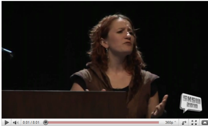
Figure 1. Danah Boyd Talks About Privacy

Perhaps the single largest objection to having students post their work publicly (whether within an LMS or beyond) is the notion of privacy guarantees. People have talked about privacy within online learning nearly since its inception (Tu, 2002a, 2002b), and with the rise of social media, they are returning to this question (Boyd, 2010; Lenhart & Madden, 2007; Rooney, 2010). Privacy, though, is not nearly as simplistic as people often believe. 6 Danah Boyd, a social media researcher at Microsoft, recently gave a talk at South by Southwest (SXSW) (see Figure 1) in which she explains how complicated privacy is and how too often most people think of "public" versus "private" as simple binaries when in fact they are much more complicated than that.